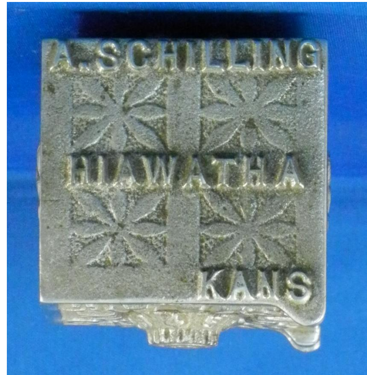
REGENT SAFE #17 ISB - UNLISTED Height 4" (6 PIECES)