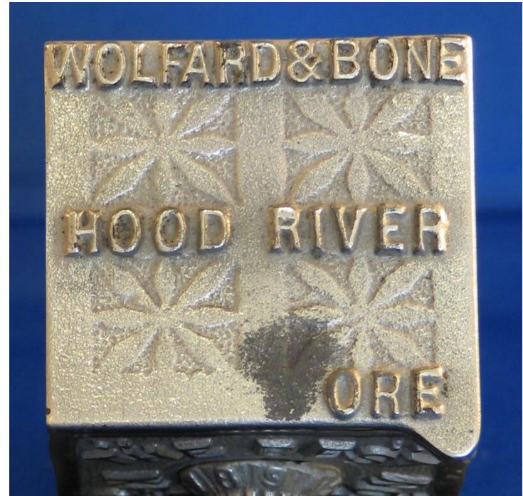
REGENT SAFE #20 ISB - UNLISTED Height 4" (6 PIECES)