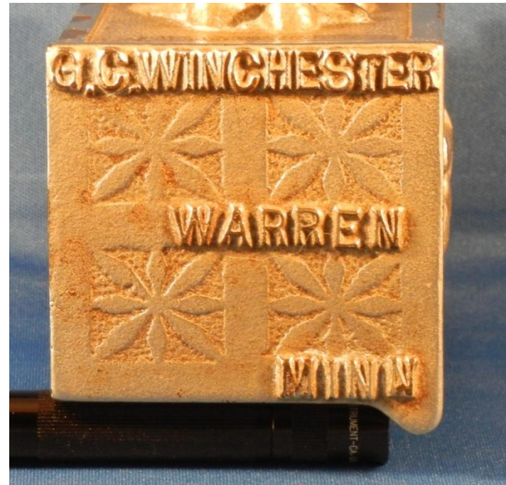
REGENT SAFE #19 ISB - UNLISTED Height 4" (6 PIECES)