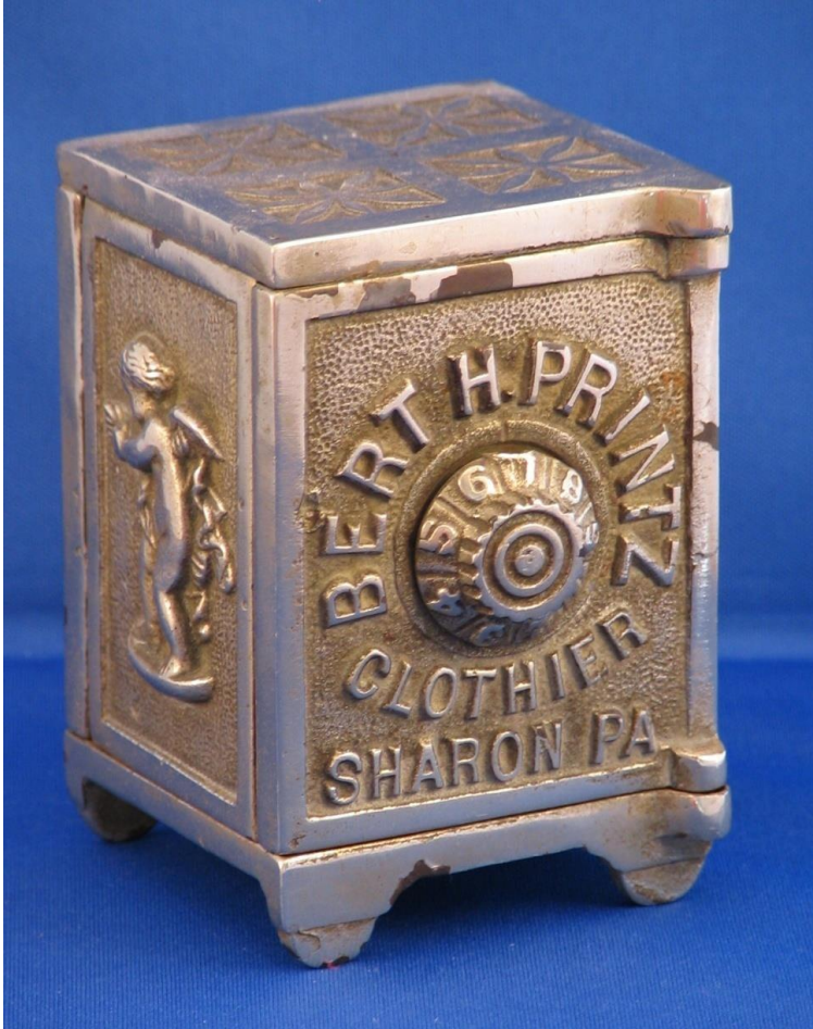
REGENT SAFE #3 ISB - UNLISTED Height 4" (6 PIECES)