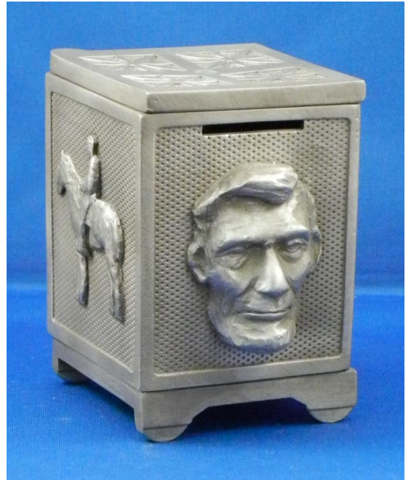
MODERN SAFE ISB – UNLISTED Height 4" (3 PIECES)