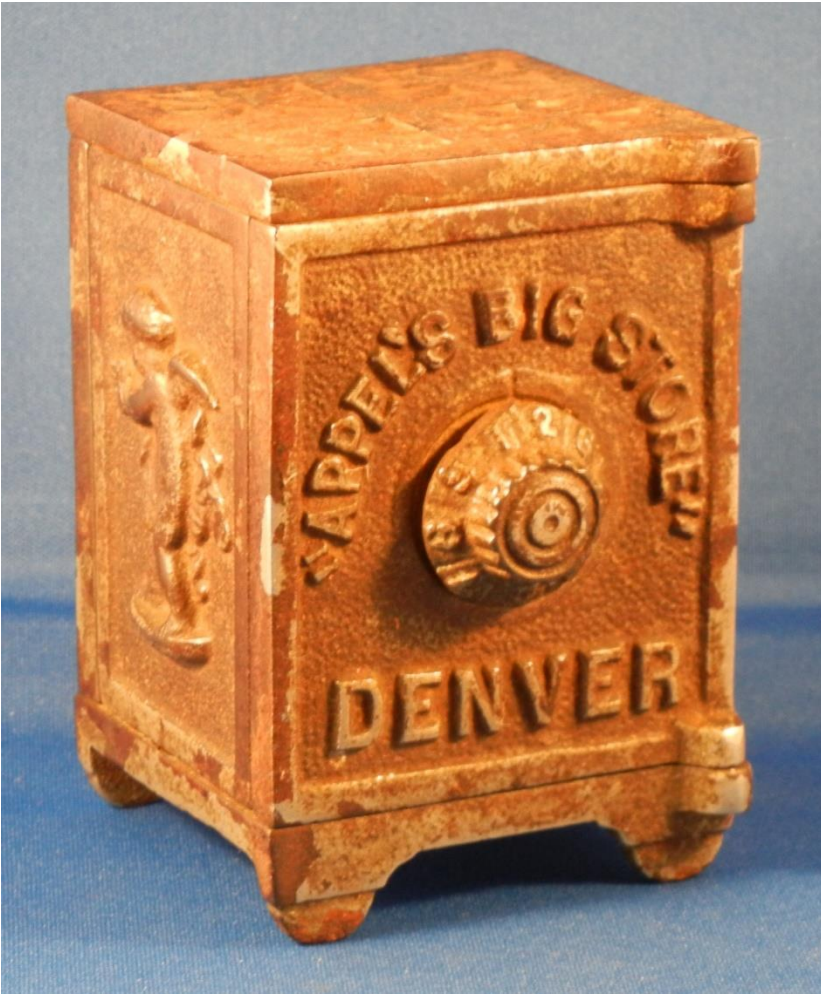
REGENT SAFE #1 ISB #61 Height 4" (6 PIECES)