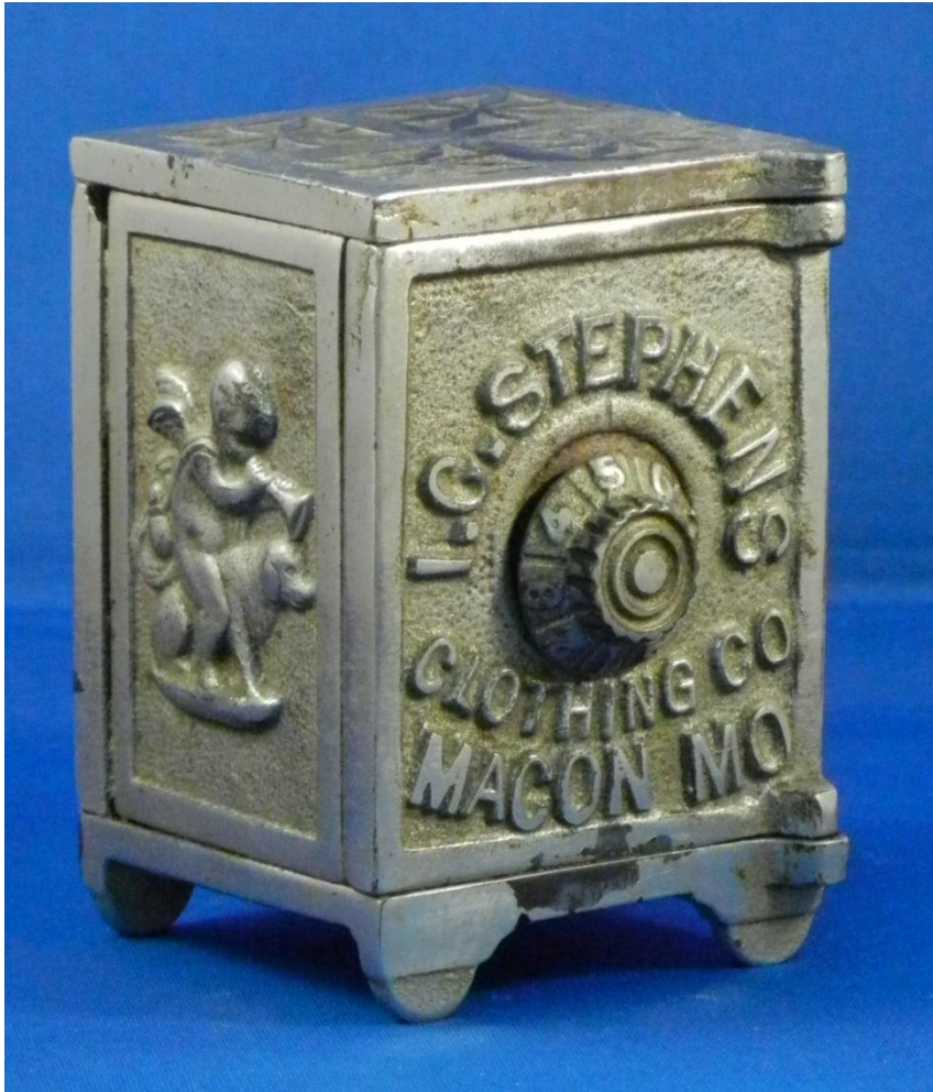
REGENT SAFE #13 ISB - UNLISTED Height 4" (6 PIECES)