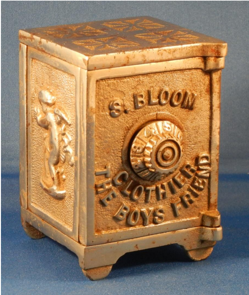
REGENT SAFE #2 ISB - UNLISTED Height 4" (6 PIECES)