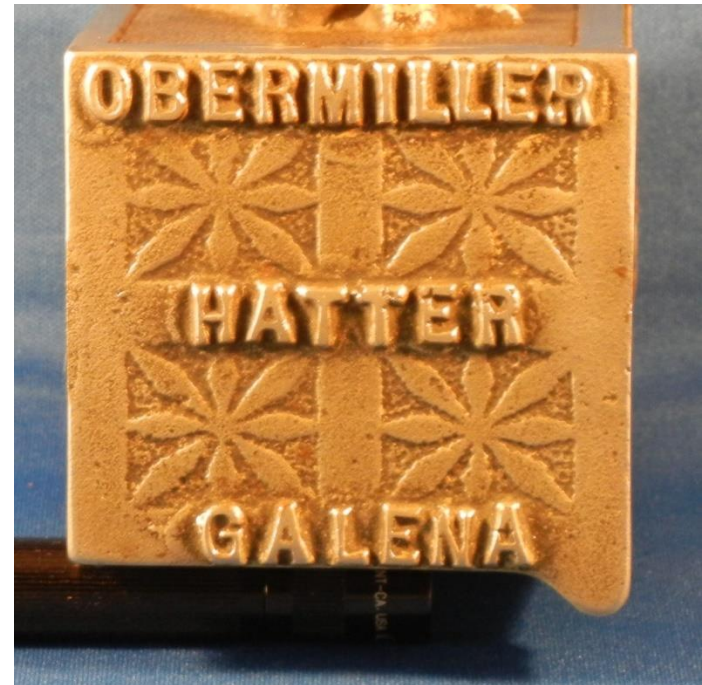
REGENT SAFE #11 ISB SUPPLEMENT 1 - #6 Height 4" (6 PIECES)