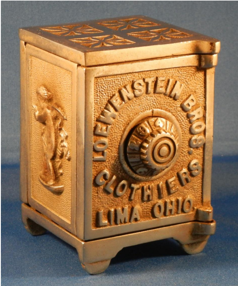
REGENT SAFE #10 ISB - UNLISTED Height 4" (6 PIECES)