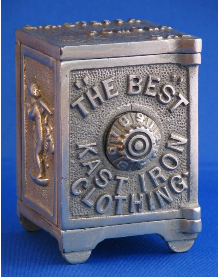
REGENT SAFE #18 ISB - UNLISTED Height 4" (6 PIECES)